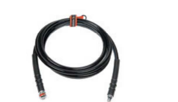
Hose CORE 6' Black (for specifications see page 23)