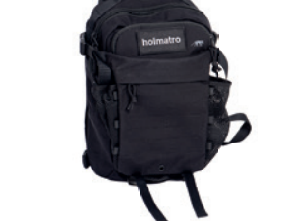
Backpack Pump GBP10EVO3