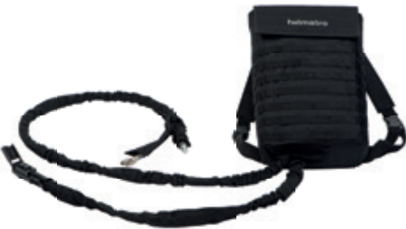
HDB P 240 ST (WO) - CGA

To be used in combination with one of the Door Blaster Packs.