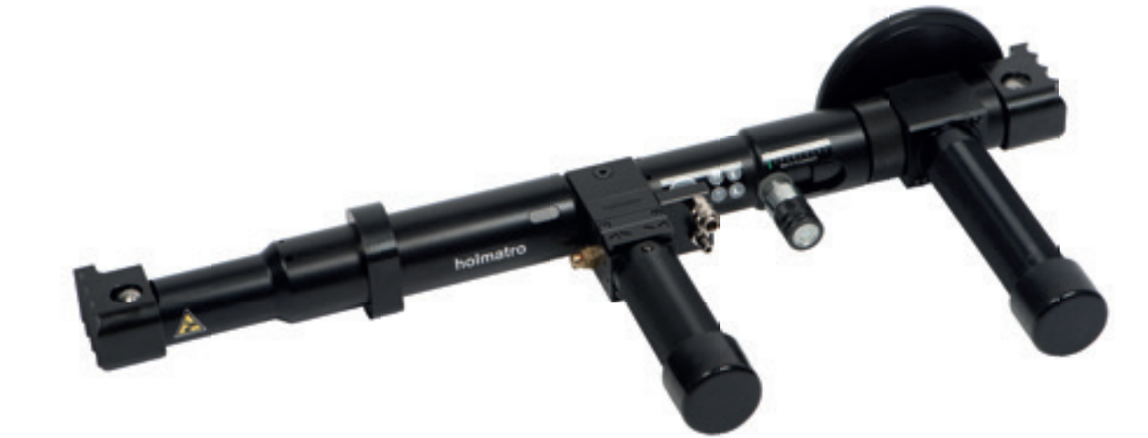
HDB 90 ST