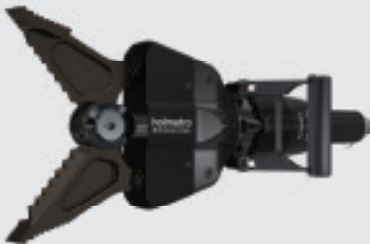
CT 5111 ST

The backpack pump can also drive other Holmatro Special Tactics CORE Tools, such as the compact and lightweight combi tools CT 5111 ST (highest spreading force).