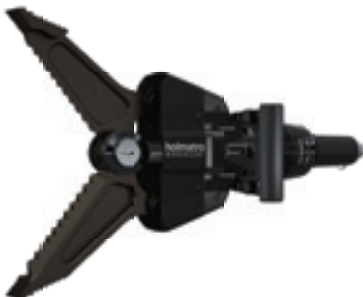
CT 5114 ST