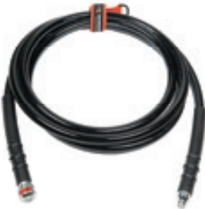
Hose Core 6' black