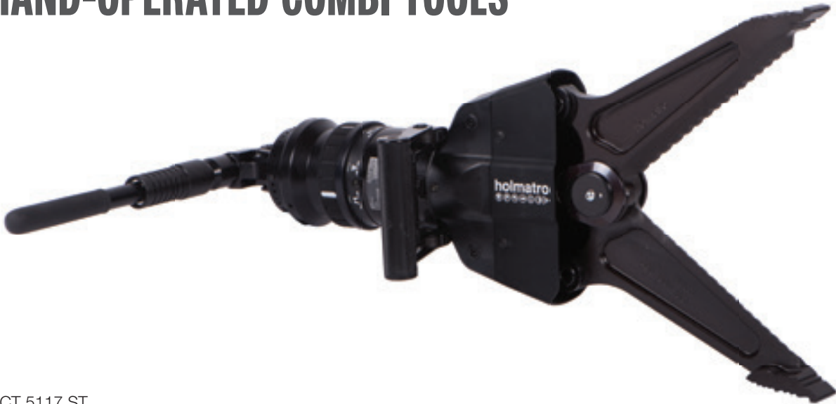
HCT 5117 ST