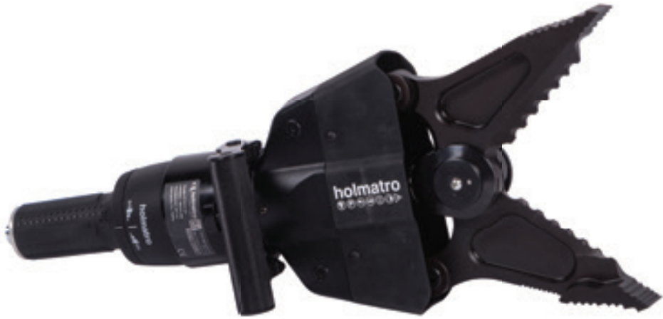
CT 5111 ST

Discover all features and benefits of the Holmatro Pentheon Series on holmatro.com/pentheon