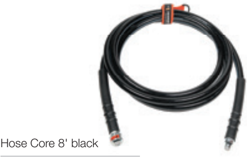
Hose Core 8' black